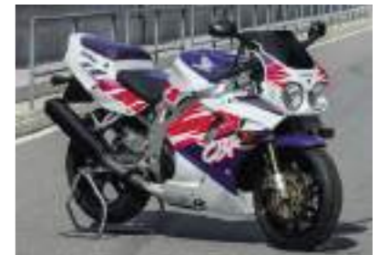
The CBR900RR Fireblade that started it all.

Aiming to create a high-performance motorcycle that could defeat its own RVF750 in Endurance Road Races, Honda developed an R&D project that led directly to the CBR900RR, in 1992. With 128 HP, it was not the most powerful of its time. However, thanks to a dry weight of 185 kg when all rivals were well over 200 kg, the first Fireblade, soon nicknamed "Blade" by the fans, was so easy to control that it seemed to read its rider's mind. More than 25 years after, the most powerful and nimble Honda bikes keep carrying the Blade legacy.