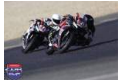
The CBR500R Cup.

It's not rare to find some CB500 proudly boasting more than 300,000 km (more than 186,000 miles), but the long-time favourite of the couriers and the driving school is much more than a workhorse. Beginning in France in 1996, the CB500 Cup spread across Europe quickly. Since 2014, it is on CBR500R that young talents try to make a name by themselves, on a budget. Sebastien Charpentier or James Toseland, to name a few, started there.