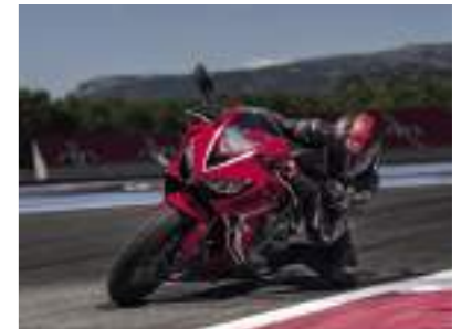
The CBR650R in action.

Since 1999, with the ST1100 Pan European model, Honda have equipped more and more of its motorcycles with a system called Honda Selectable Torque Control (HSTC). This system constantly monitors the speeds of the front and rear wheels via speed sensors incorporated into the Anti-Lock Braking System (ABS). When the rear wheel begins to rotate significantly faster than the front, the systems reduces fuel delivery to the engine, limiting rear-wheel slippage. In 2019 with the new CBR650R, Honda applied this technology to its mid-displacement Supersport motorcycle for the first time. The rider can deactivate it on demand.