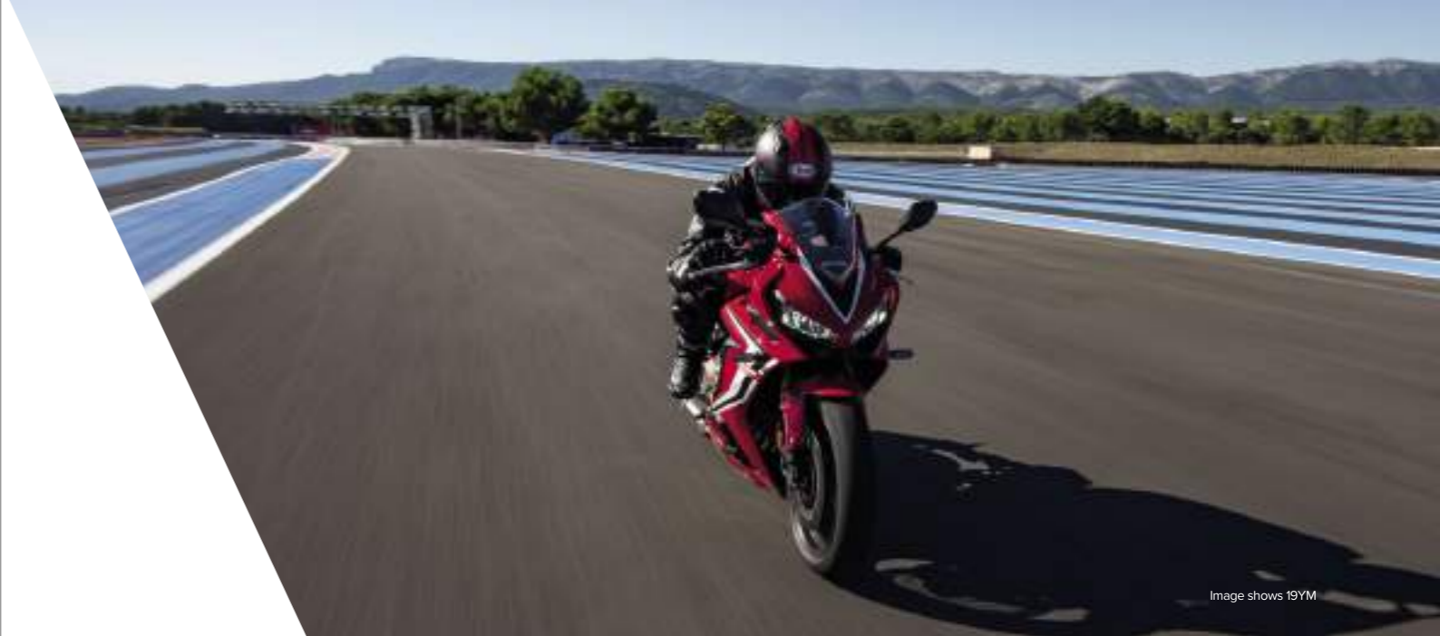
Image shows 19YM

Dimensions in mm (W x L x H): 355 x 365 x 243.